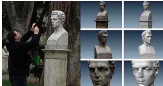
Low-cost digital camera used for 3D scanning a marble bust (left), and the resultant scan and conversion to a 3D model (right), courtesy of Direct Dimensions, Inc.

Over the past quarter century, the applications for 3D scanning have steadily widened beyond its early use for dimensional metrology in the aerospace, automotive, and power generation industries. The measurement instruments used for these industrial metrology applications are still relatively complex and expensive. Today, much less expensive equipment is being employed for 3D scanning, and the technology has found its way into many educational institutions and some homes. Even a simple digital camera in mobile devices can be used as a 3D scanner for many interesting applications. Nevertheless, industrial customers have always been, and still are, the primary funding source for 3D scanning technology R&D.