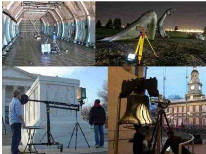
Large-scale scanning applications include airplanes, art, architecture, and artifacts, courtesy of Direct Dimensions, Inc.

For scanning larger objects, such as aircraft, ships, wind turbines, and buildings and sites, a fast-growing category of scanning technology has emerged. Known as spherical scanners, they have transformed the traditional surveying industry. Many surveyors and engineers are rapidly adopting these tripod-mounted area-scanning instruments. Their benefits include relative ease of use, improved scanning accuracy and density, and speed advantages as compared to conventional single-point line-of-sight optical instruments. They are generally considered “long-range” scanners with capabilities in the range of hundreds of meters. They provide the capability to quickly set up and capture entire factories, crime scenes, movie sets, and many other larger scale targets, including color information.