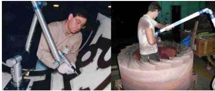
Two examples of portable articulated arm CMMs being used for 3D measurement in a manufacturing environment

A new class of metrology equipment emerged that allowed 3D measurement to take place on the factory floor instead of inside a dedicated CMM room. New instruments such as laser and optical trackers, portable arm CMMs, and structured-light scanners became available. They helped engineers solve critical manufacturing issues, which led to increased demand and more R&D by scanner manufacturers. Using these tools, parts designed and engineered in 3D CAD could be inspected directly, sometimes while still on a machine or in a tooling fixture. Thus, 3D scanning technologies have experienced dramatic improvement in speed, accuracy, portability, and reliability at a rate that is similar to growth in the electronics industry.