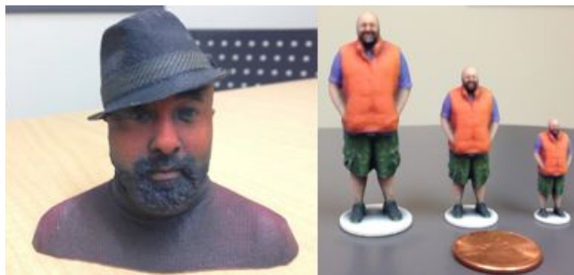
Typical 3D-printed figurines made by various types of 3D scanning systems

A new set of 3D scanning tools has emerged that is democratizing cost and availability for individual consumers. Mobile phone-based apps, such as 123D Catch from Autodesk and the RealSense sensor from Intel, bring the concept of capturing objects and scenes to the masses. This is similar to the way low-cost desktop 3D printers are democratizing 3D printing. Many of these solutions are even free, although they do not always deliver the best results. Other low-cost tools have launched recently, some through crowd-funding platforms. These new 3D scanning tools include several solutions that capture a rotating object with a projected laser line. By projecting a structured-light source onto surfaces, this movement-based 3D imaging can be more accurate than using still digital camera images, although the technology is usually more expensive.