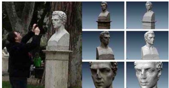
Low-cost digital camera used for 3D scanning a marble bust (left), and the resultant scan and conversion to a 3D model (right)

Over the past quarter century, the applications for 3D scanning have steadily widened beyond its early use for dimensional metrology in the aerospace, automotive, and power generation industries. The measurement instruments used for these industrial metrology applications are still relatively complex and expensive. Today, much less-expensive equipment is being employed for 3D scanning, and the technology has found its way into many educational institutions and some homes. Even a simple digital camera in mobile devices today can be used as a 3D scanner for many interesting applications. Nevertheless, industrial customers have always been and still are the primary funding source for 3D-scanning technology R&D.