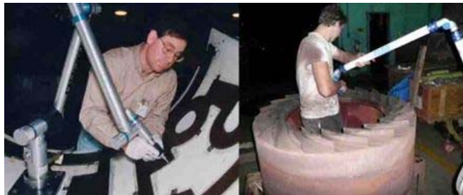
Two examples of portable articulated arm CMMs being used for 3D measurement in a manufacturing environment

A new class of metrology equipment emerged that allowed 3D measurement to take place on the factory floor instead of inside a dedicated CMM room. New instruments such as laser trackers, portable arm CMMs, and white-light scanners helped engineers solve critical manufacturing issues, which led to increased demand and more R&D by scanner manufacturers. Parts were designed and engineered in 3D CAD and could be inspected directly, sometimes while still on a machine or in a tooling fixture, using these advanced 3D measurement and analysis tools. Thus, 3D-scanning technologies have experienced dramatic improvement in speed, accuracy, portability, and reliability at a rate that is similar to growth in the electronics industry.