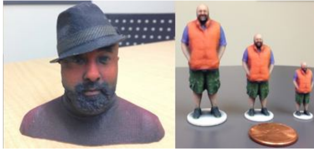
Typical 3D-printed figurines made by various types of 3D scanning systems, courtesy of Direct Dimensions and ShapeShot