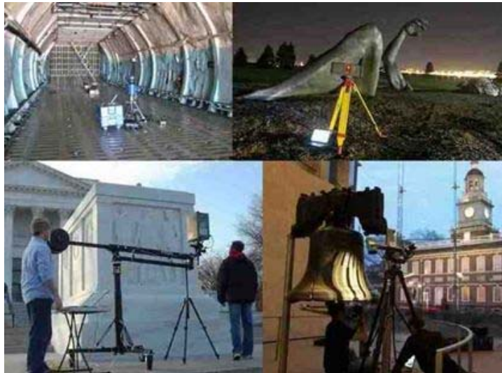
Large-scale scanning applications include airplanes, art, architecture, and artifacts, courtesy of Direct Dimensions, Inc.

For scanning larger objects, such as aircraft, ships, wind turbines, and buildings and sites, a fast-growing category of scanning technology known as spherical scanners has transformed the surveying industry. Many surveyors and engineers are rapidly adopting these tripod-mounted area-scanning instruments because of their relative ease of use, scanning accuracy and density, and speed advantages as compared to conventional single-point line-of-sight optical instruments. Generally considered “long-range” scanners with capabilities in the hundreds of meter range, they provide the capability to quickly set up and capture entire factories, crime scenes, movie sets, and many other larger scale targets, including color information.