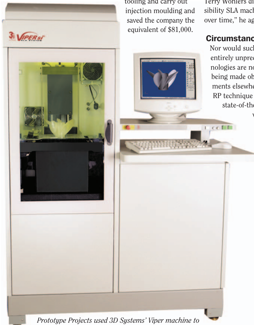
Prototype Projects used 3D Systems' Viper machine to meet Atco-Qualcast's stringent timetable